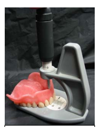
(Figure 2) The Alma Gauge provides precise information when duplicating an existing denture.

process, rather than at the insertion appointment. This technique does require that the