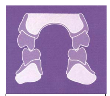
(Figure 5) Lingualized occlusion places vertical force in the center of the mandibular ridge, thereby increasing denture stability.

translucent "Pearl Effect" hardened resin, they are the most natural appearing denture teeth on the market. Ivoclar teeth provide the standard for a truly aesthetic and functional prosthesis. We will be using these teeth on all full denture cases, converting other tooth manufacturer's shades and moulds to satisfy the aesthetic requirement of the patient. We have enclosed a mould chart and a shade/mould conversion guide that we use to convert other manufacturer's tooth lines. Shade guides are also available from the laboratory.