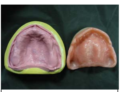
(Figure 1) A processed Ivocap base, with postdam, allows the fit of the denture to be approved at the biterim appointment. The silicone model allows us to verify the successful fit of the finished denture.

The changes in our technique begin when we receive the final impressions or models, preferably taken with custom trays. At this point we produce an Ivocap injected acrylic base, with postdam and wax bite rim (Figure 1). This innovative step in the procedure is a major advantage of our new system. Injected bases are significantly more stable than wax, shellac, or light cured bases allowing for a more accurate bite registration. More importantly, the processed base is incorporated into and becomes the final tissue-bearing surface of the finished denture. This affords you the opportunity to evaluate and adjust the borders of the denture to your complete satisfaction early in the fabrication