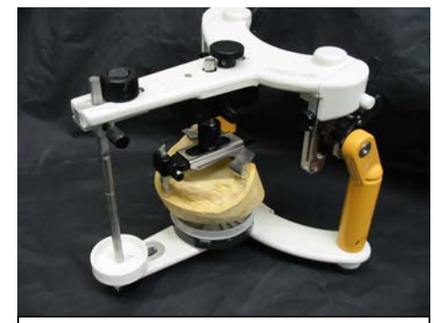
(Figure 3) The horizontal mounting guide produces an ideal orientation of the master cast on the Stratos 200 without a facebow.

new articulator. This instrument has two unique features: a guide for ideal articulation, with or without a facebow, and a template to improve occlusal balance and function. In the absence of a facebow, we mount the mandibular cast with a specially designed horizontal guide (Figure 3). This guide relies on the mucolabial folds and the trigonum of the retromolar pads to orient the cast within the Bonwill Triangle. The articulator also utilizes either a two or threedimensional template to facilitate a consistent and accurate tooth set-up (Figure 4). For the first time, this innovative articulation system allows us